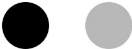
Figure 1: An example visual experience